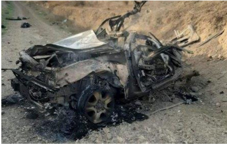
The result of a mine explosion in Fizuli district, which killed 4 people

On December 13, 2020, in the Aghdam district, 3 people, one military serviceman and two civilians were hit by the landmine, as a result of which one civilian was killed and two others were injured.