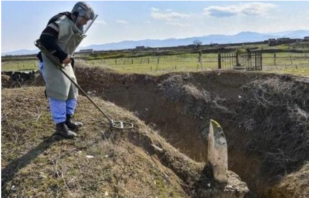
“Trenched graves” – photo from a cemetery in the village of Marzili in Aghdam district

It is also a well-known fact that landmines are a major obstacle to rehabilitation and humanitarian aid in the affected areas.