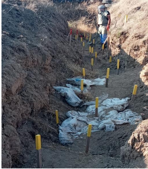
Photos of Landmines found in the liberated territories